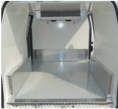
Regular Insulated Reefervan