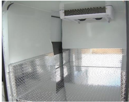
Regular Insulated Reefervan

Sales, installation and after sales service support is widely available across USA and Canada.